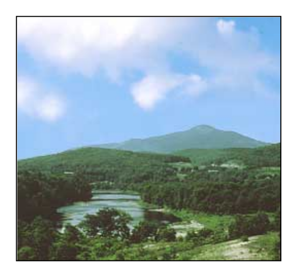
Windsor, VT – Ascutney Mountain looks like a gentle climb from a distance, but it is one of six challenging mountain races that are part of the USATF Mountain series.

Great things happen when men and mountains collide...For those who have never considered the New England Mountain Series, here's my shameless plug. I recommend giving it a try. I've run the series in its entirety for the last 4 years, 5 years total, and am well on my way to completing it again this year. It's a USATF series, similar to the well-known series that many follow around New England each year. It has, to say the least, its own set of added challenges, as anybody can see. Running the mountains means fighting gravity all the time, but it comes with its own rewards as well. The first race of the series is always a reunion of sorts; runners that run the series year-after-year getting together after a long cold winter. The races are smaller than regular USATF races, entry fees are on average, much lower. The past two years has seen only I of the 6 races with an entry over $20.