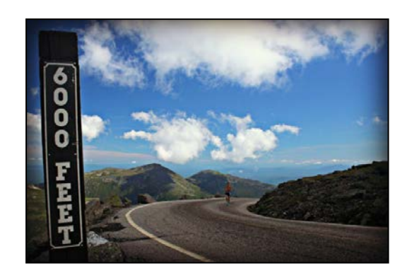
Gorham, NH - Runners climb more than 4,500 foot over the course of the race's 7.6-mile route.

morning likely required a bit of heat and defrost to keep the old windshield clear, 55 degrees at the start, and 50 cloudless degrees at the top, with a view that only the natural curvature of the earth prevented you from seeing further. A better day could not have been custom ordered. For those of you that ran for the first time, be forewarned. In my 20+ years, this year's was the best weather, with only one or two even close. Bring warm duds next year, chances are you'll need 'em.