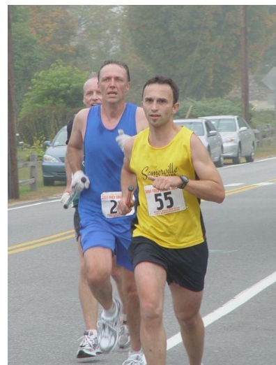
Winnepesaukee Relay