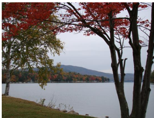
Bristol, NH – Autumn arrives at New Found Lake