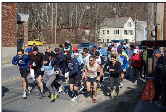
Fitchburg, MA – On your mark...get set...go. Runners poised at the start of the Log Cabin 10K.