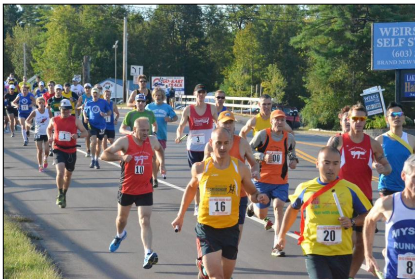
The Last Start – Weirs Beach, NH - Leg 1 runners on their initial descent toward the Lake at the 2013 Relay; the 25 th and final year of the event.

Weirs Beach, NH – Sadly, this article qualifies as an obituary. The esteemed and venerable Lake Winnepesaukee Relay has run its course. After 25 years, last September's Relay was the last. Including its predecessor, the Plymouth Rock to Provincetown Relay, it goes back 40 years, to 1974. That year, the old timers of NMC and a number of other clubs thought it would be a 'lark' to see if they could run teams of 8 runners over an 80+ mile course that finished at the point in Provincetown.